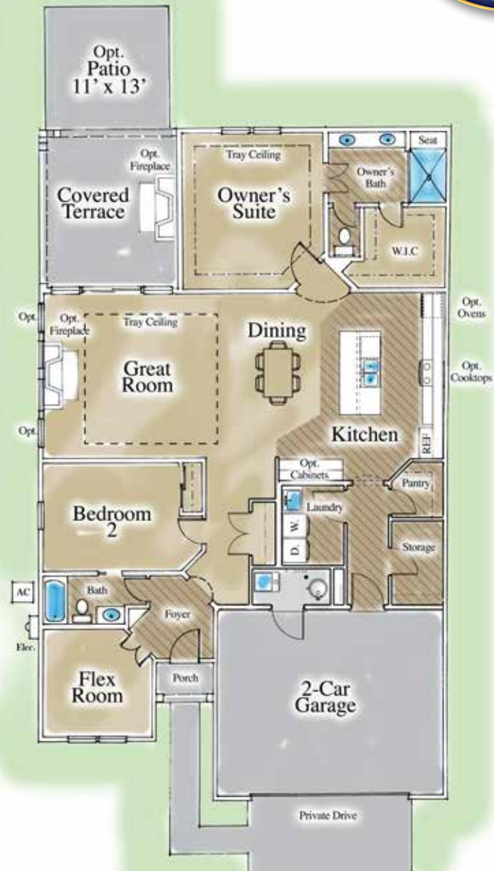
BASE FLOOR PLAN

Liberty Grand • 7100 Liberty Grand Drive • Liberty Twp, OH 45069 • 513.777.2210 • www.LibertyGoGRAND.com