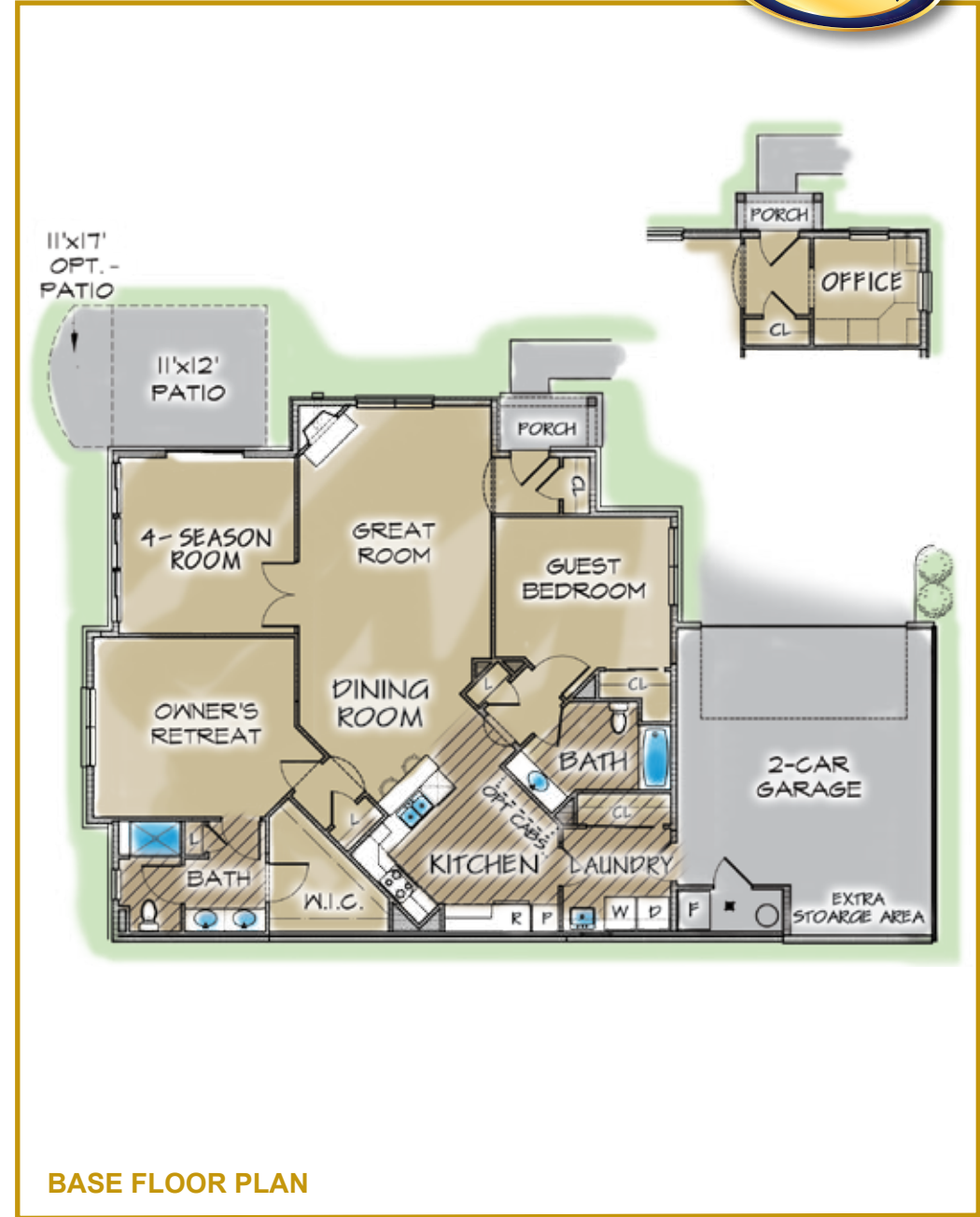
BASE FLOOR PLAN

Liberty Grand • 7100 Liberty Grand Drive • Liberty Twp, OH 45069 • 513.777.2210 • www.LibertyGoGRAND.com